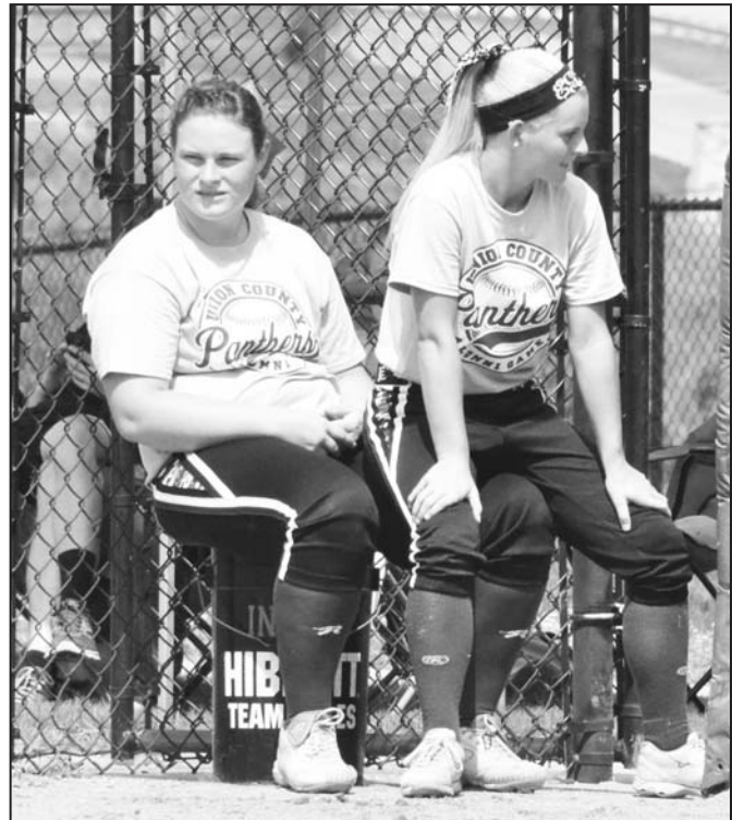
The current Lady Panthers may have been guilty of underestimating their elders.