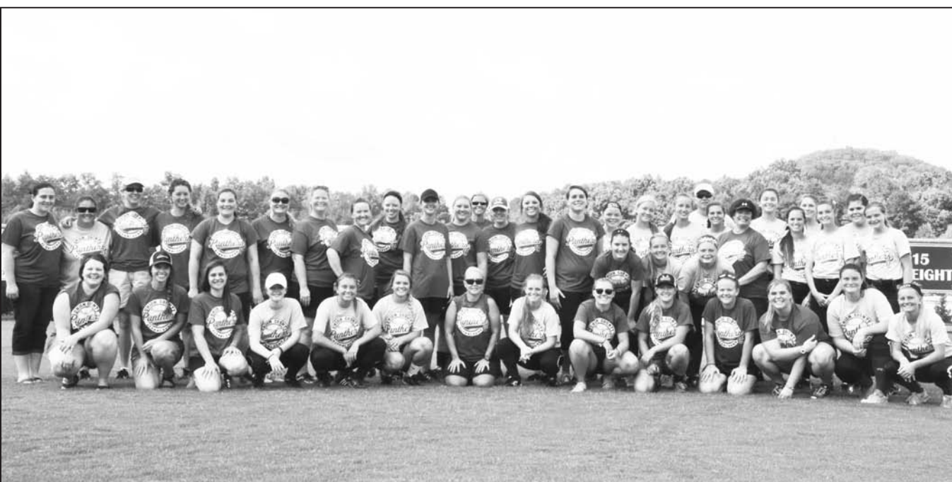
The first annual Union County softball Alumni game pitted the current Lady Panthers against the former players. The youngsters took an early 2-0 lead during the fast pitch innings but the savvy veterans bided their time until the slow pitch innings and rallied for the 7-6 victory.